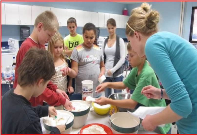
After School Cooking Club—November 15, 2011

"It's where staff go "above and beyond" what's expected."