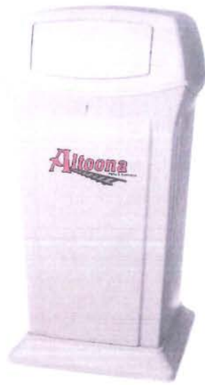
Artwork 2370 in beig_Page_2

Name: ALTOONA PARKS AND RECREATION (black brown red) Type: Decal / Label