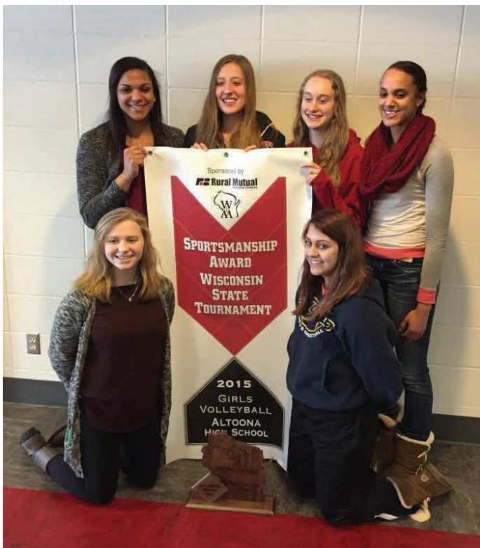
Lady Rails Volleyball State Tournament Sportsmanship Award Recipients

Community. Sportsmanship. Teamwork. Partnerships.