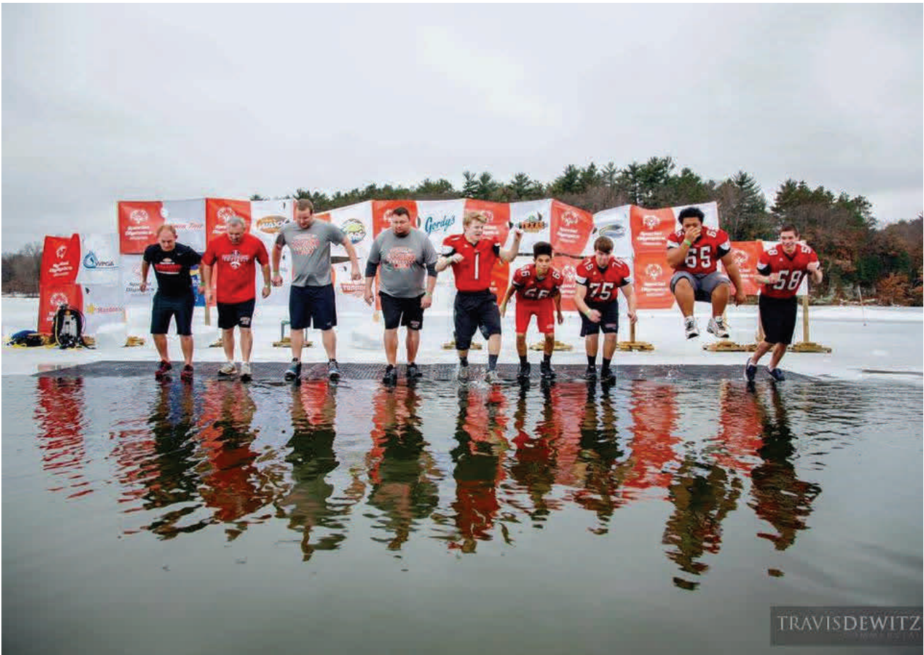
Railroader Football raised $840 for Special Olympics in the 2016 Polar Plunge