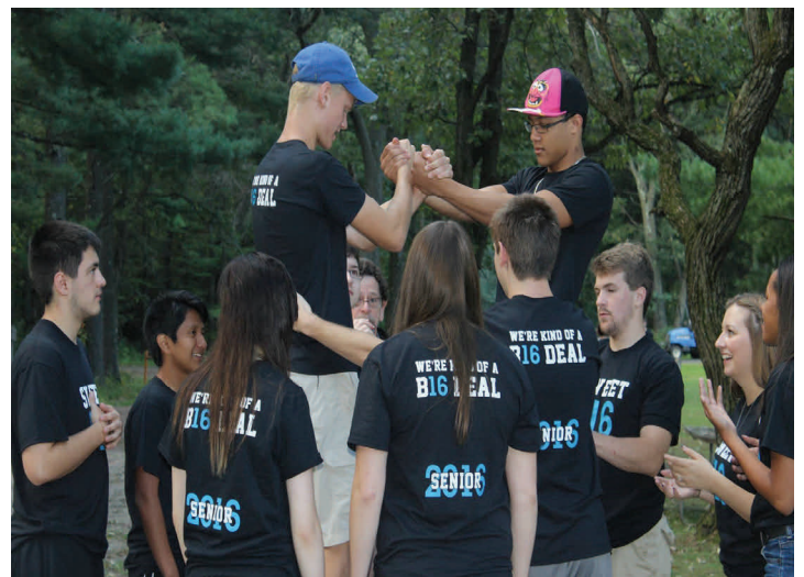
2016 Senior Leadership Day

Just a few words used to describe the AHS student body & staff.